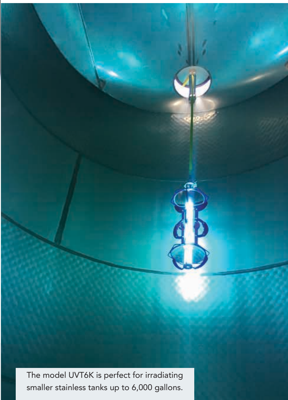
The model UVT6K is perfect for irradiating smaller stainless tanks up to 6,000 gallons.