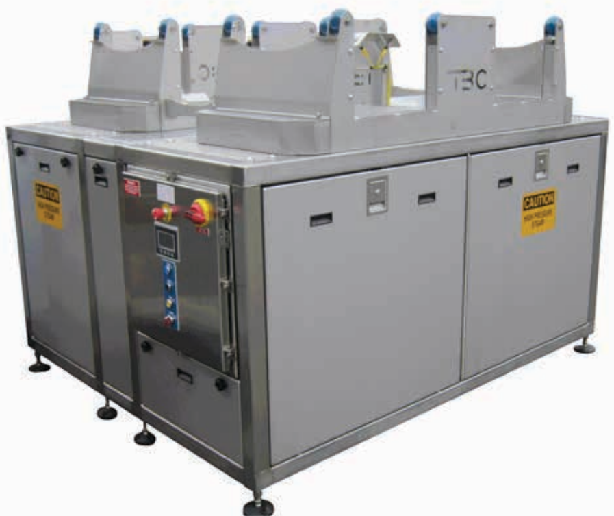
(Top) The new 2 and 4 automated barrel washers are fully self-contained and perfect for the small to mid-sized winery.