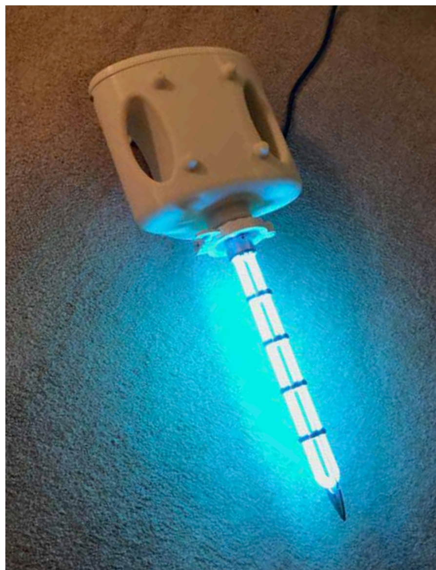
Just released the UV60G is designed specifically for wine barrels.